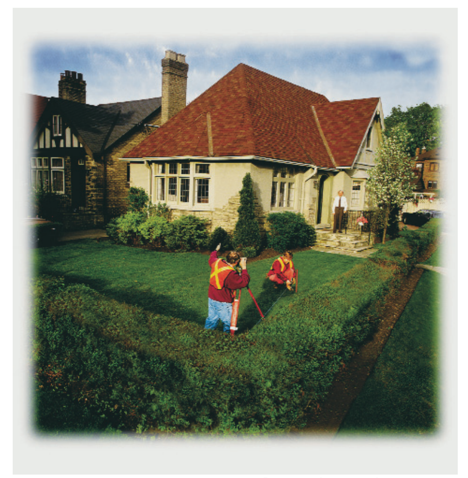
Protect the most important investment...your home!